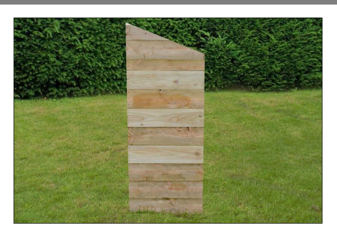
Affix the partition panel to the centre posts of the store....